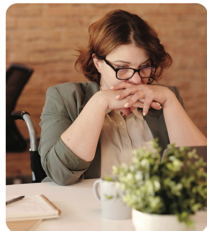
MARCUS AURELIUS / PEXELS