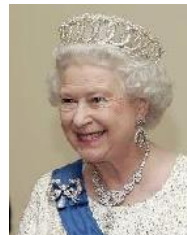
Her Majesty Queen Elizabeth II, 21 st April 1926 – 8 th September 2022.