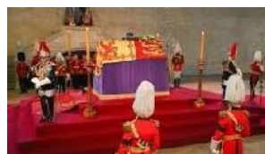
State Funeral – Monday, 19 th September 2022 starting at 7:00 a.m. (Bermuda time)