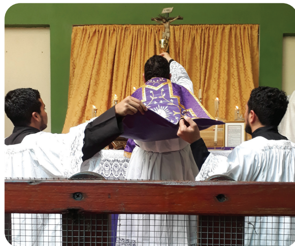
PROFESSANT / CATHOPIC

All that being said, to those who enjoy socializing or who must leave the Mass before the final note of the final hymn: do be considerate of those praying near you. They might be praying for you! ●