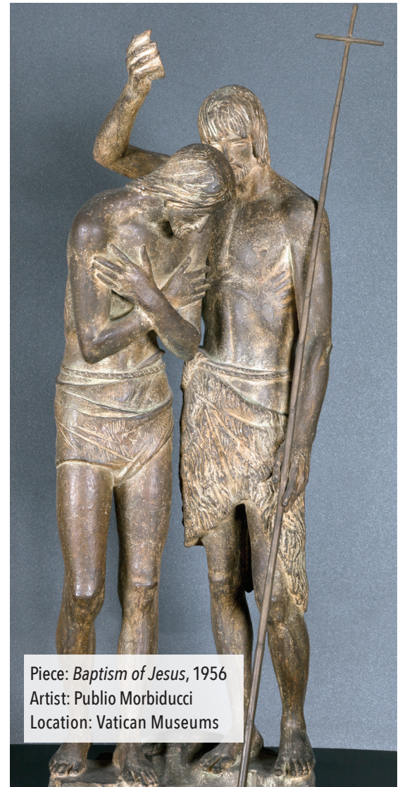
Piece: Baptism of Jesus , 1956 Artist: Publio Morbiducci Location: Vatican Museums

(John said,) "I am baptizing you with water, but...he will baptize you with the holy Spirit and fire."