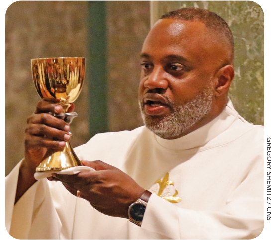
GREGORY SHERMITZ / CNS