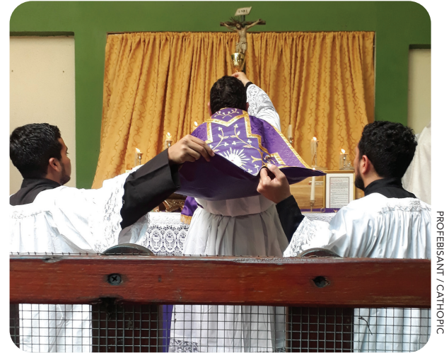
PROFIBSANT / CATHOPIC

Go to DearPadre.org to send your question and to learn more about Dear Padre .