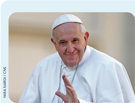
YARA NARDI / CNS