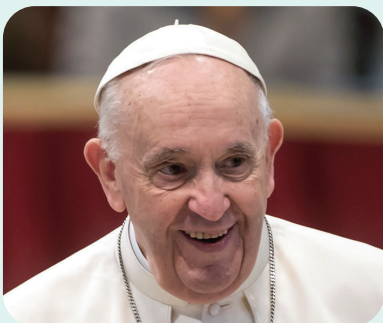
STEFANO DAL POLOZZO / CNS