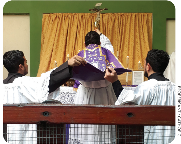
PROFIBSANT / CATHOPIC