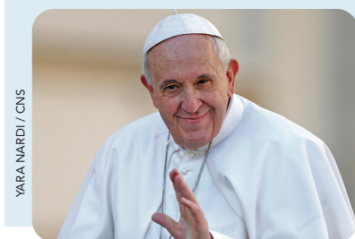
YARA NARDI / CNS