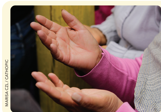
MARISA CZL / CATHOPIC