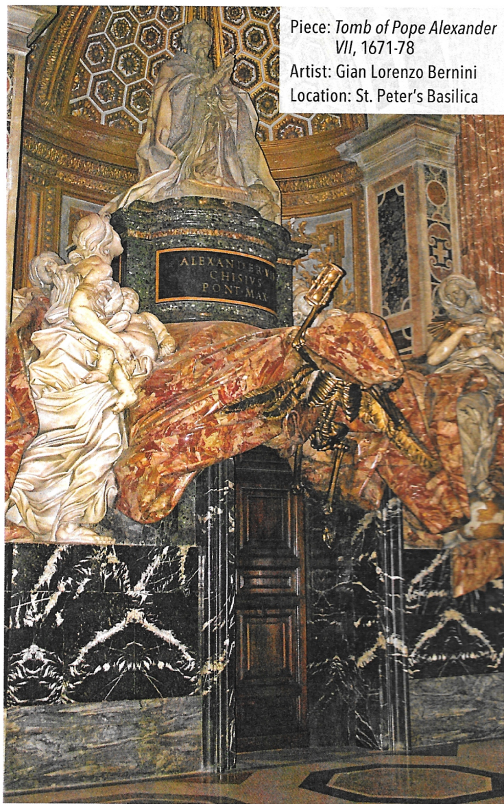
Piece: Tomb of Pope Alexander VII , 1671-78

Do I look more for my own progress and protection, or that of others?